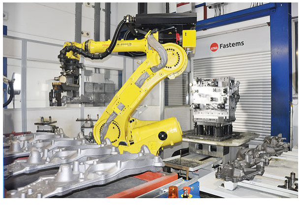
Fastems MMS for Part Handling offers batch production and setup scheduling for CNC lathes and machining centers.

When choosing a gripper, he added, the first step is to identify what type of workpiece you're trying to hang on to, whether it's a cylinder, cube, or more random shape such as a casting. There should be enough fingers to grip the parts securely and safely but without damaging it, and the system should be