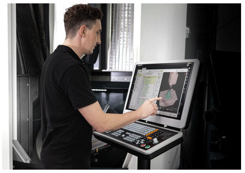
PRODUCT DESIGN & ENGINEERING