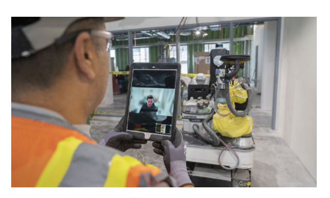
As with many robotic solutions, Canvas provides remote support to its users through a mobile device interface.

Decades of offshoring coupled with a societal "trades-are-dirty" mindset have left the United States manufacturing industry wedged firmly between a rock and the proverbial hard place. Machine shops, moldmaking houses, sheet metal fabricators, and plastic