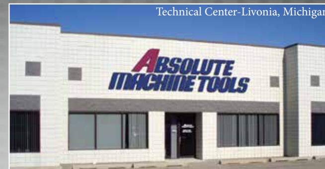
Technical Center-Livonia, Michigan

Absolute helps machine shops and manufacturing facilities improve their production processes to be more competitive in today's tough global environment. For 30+ years, the company has built its reputation on unsurpassed applications engineering support, after-sale service and training, and invaluable Preventive Maintenance Programs (PMP) and services.