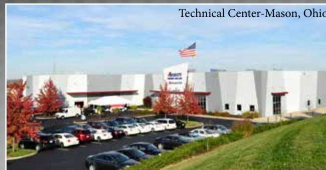
Technical Center-Mason, Ohio